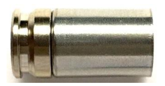
FIG 2: instructions for expanding tool for 9mm Luger and 380 ACP.

THIS PICTURE SHOWS PROPERLY SIZED CASE WITH S3 RELOAD™ DIE.