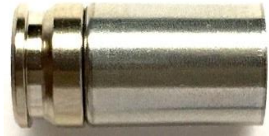
FIG 2: instructions for expanding tool.

THIS PICTURE SHOWS PROPERLY SIZED CASE WITH S3 RELOAD™ DIE.